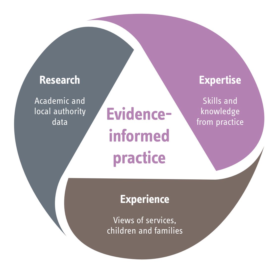
Figure 1: Evidence-informed practice triangle (Research in Practice, 2003)

The evidence-informed practice triangle in figure 1 presents three key forms of evidence that should inform professional judgement: