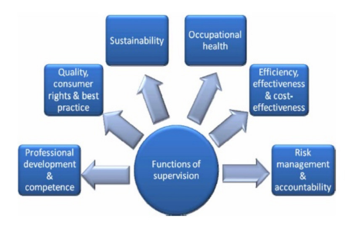
Graph 1: Swingometer of supervision (from Adamson, 2012: 197)

It is important to highlight at the outset that there is no single, agreed, way of defining the role or models of supervision. Adamson (2012) presents the different functions of supervision as a 'swingometer' (see graph 1), noting that they may at times be in competition with each other. Many practice supervisors are keenly aware of these tensions and highlight the challenges in providing supervision opportunities which cover all the elements identified by Adamson in sufficient depth. It is important to consider the impact of this given that the quality of supervision that practitioners experience is likely to have a direct bearing on the quality of their work with children and families.